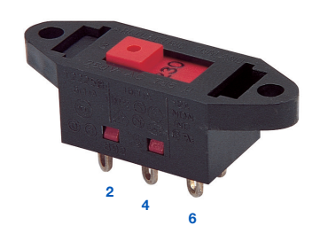
115/230 is preferred